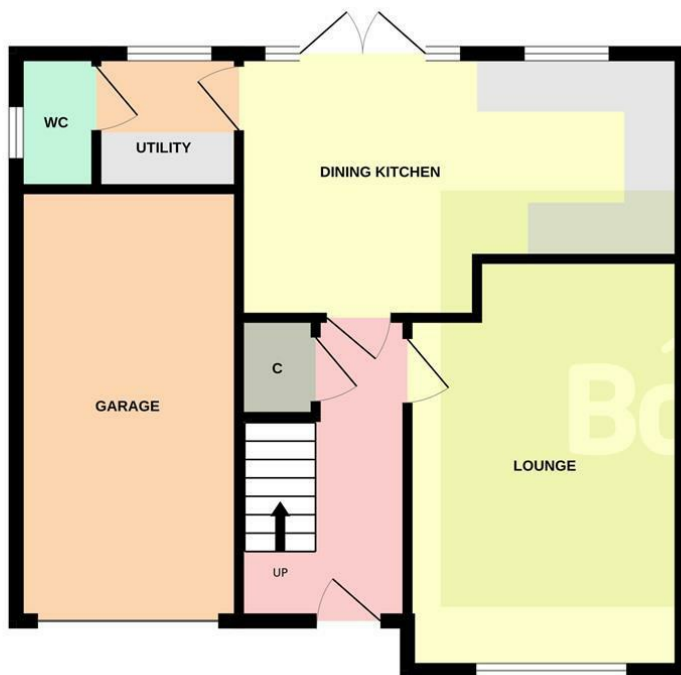
GROUND FLOOR 599 sq.ft. (55.7 sq.m.) approx.